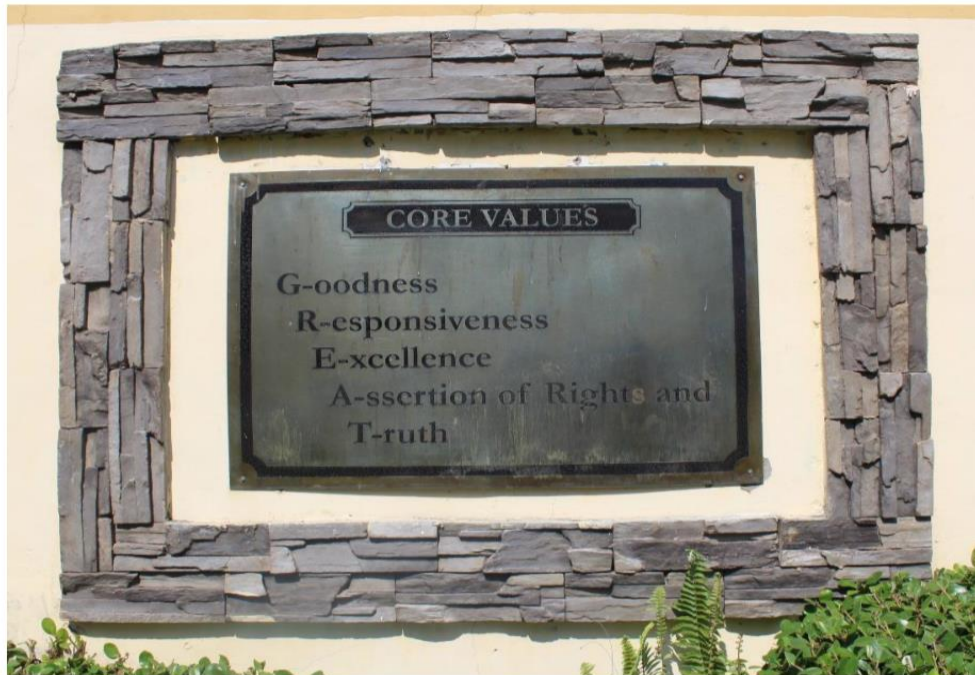
USM CORE VALUES LOCATED IN THE USM GATE