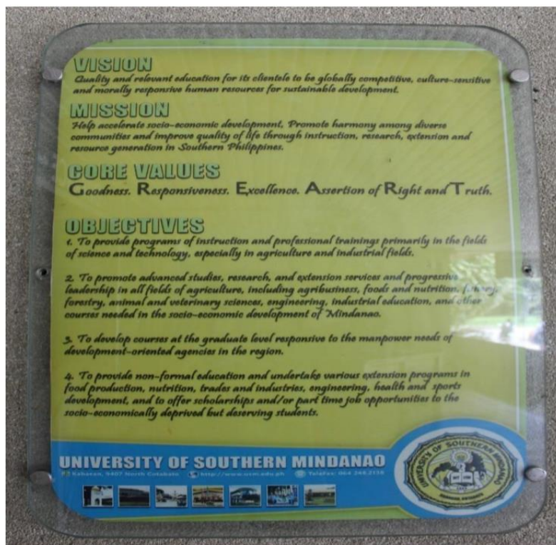
USM VMGO LOCATED IN THE ADMINISTRATION BUILDING