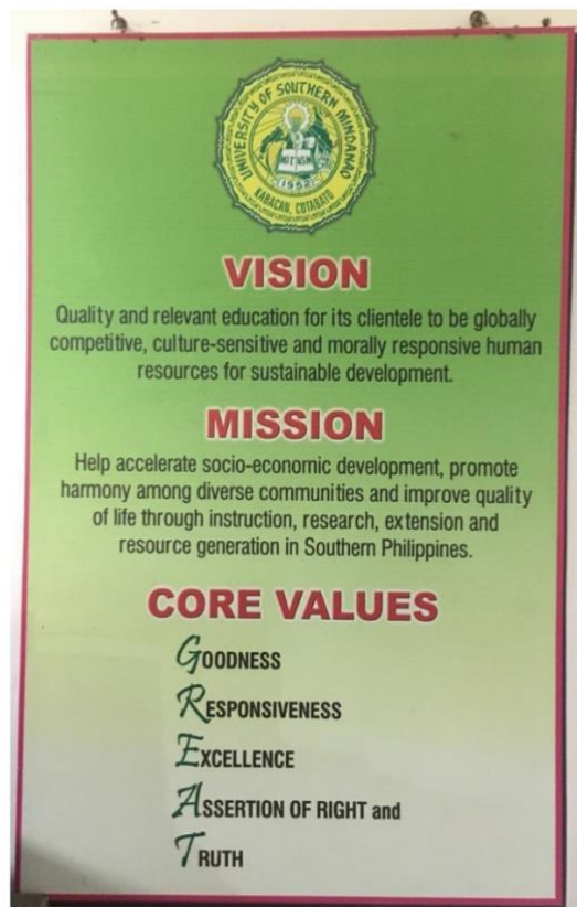
USM VMGO AND CORE VALUES POSTED INSIDE THE COLLEGE BUILDING