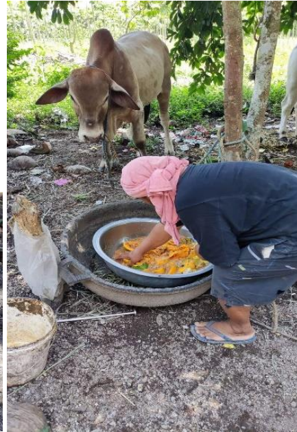
Figure 3. A para grass (left) and papaya with small amount of rice bran (right) use to feed the cattle.