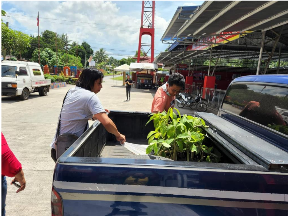
Figure 4. Unloading of forage planting materials for VBJ and delos Reyes Farm at Brgy. Poblacion, Tupi, South Cotabato.