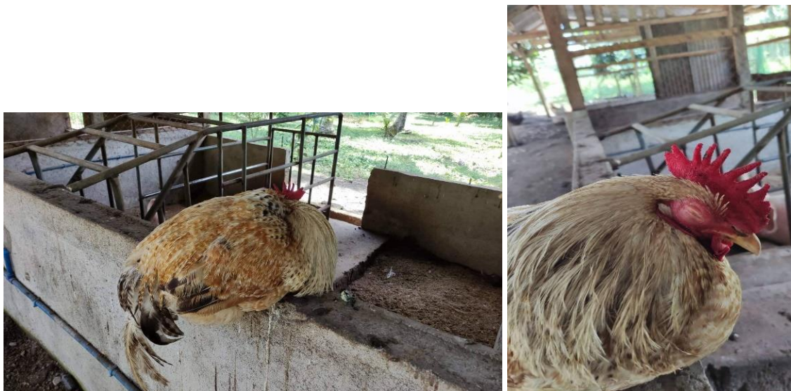
Figure 2. A chicken showing a symptom of coryza disease.