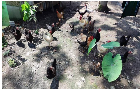
Figure. 4. The flock left from NCD outbreak