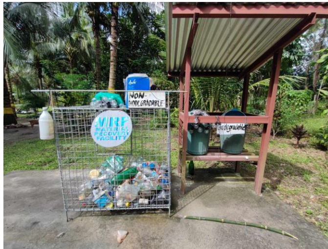
Figure 10. Implementation of proper waste disposal/management in the farm.