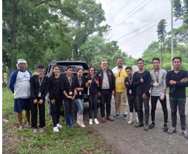
Figure 7. Provision and turn-over of planting materials to Bischick Coconut Farm for the establishment and intensification of the forage production area of improved grasses and leguminous plants.