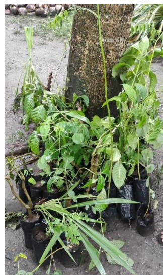
Figure 6. Unloading of forage planting materials (Sweet Napier, Trichanthera, Indigofera, Rensonii seedlings) for the establishment of forage production area of Bischick Coconut Farm at Brgy Mainuswagon, Poblacion, Tampakan, South Cotabato.