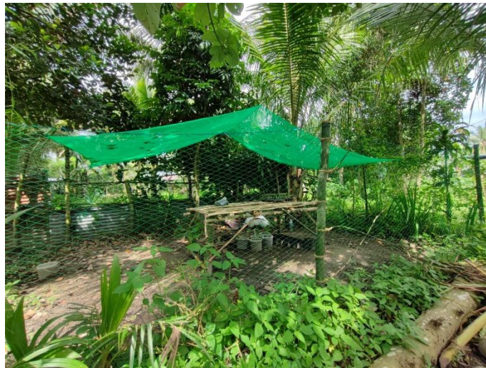
Figure 12. Newly established plant nursery area in the farm