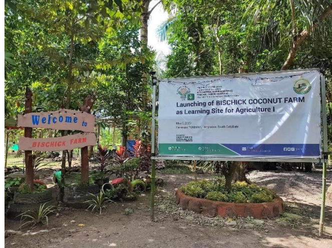
Figure 11. Bischick Coconut Farm as Learning Site for Agriculture

Republic of the Philippines DEPARTMENT OF SCIENCE AND TECHNOLOGY DOST Regional Office No. XII and UNIVERSITY OF SOUTHERN MINDANAO Kabacan, Cotabato