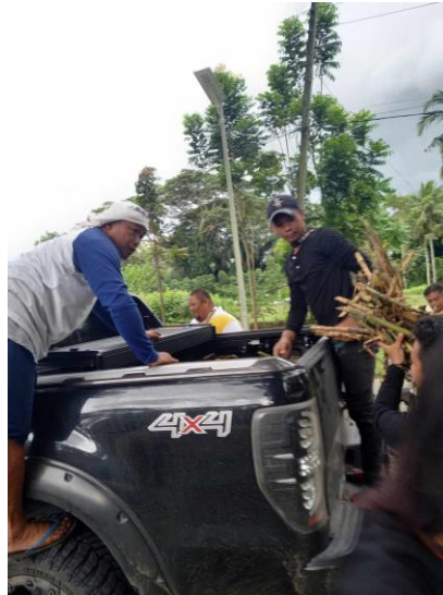
Figure 5. Loading of forage planting materials (Super Napier cuttings) for the establishment of forage production area of Bischick Coconut Farm at Brgy Mainuswagon, Poblacion, Tampakan, South Cotabato.