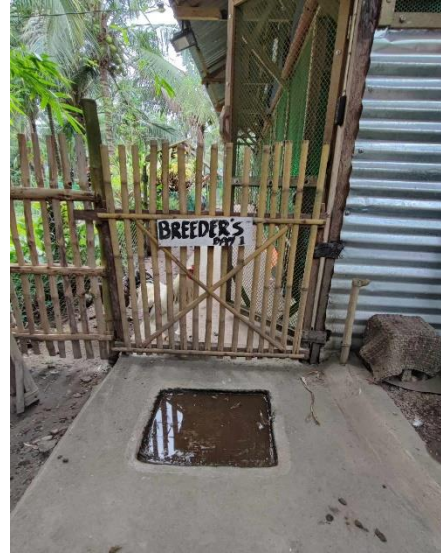
Figure 9. Implementation of biosecurity measures in the farm.