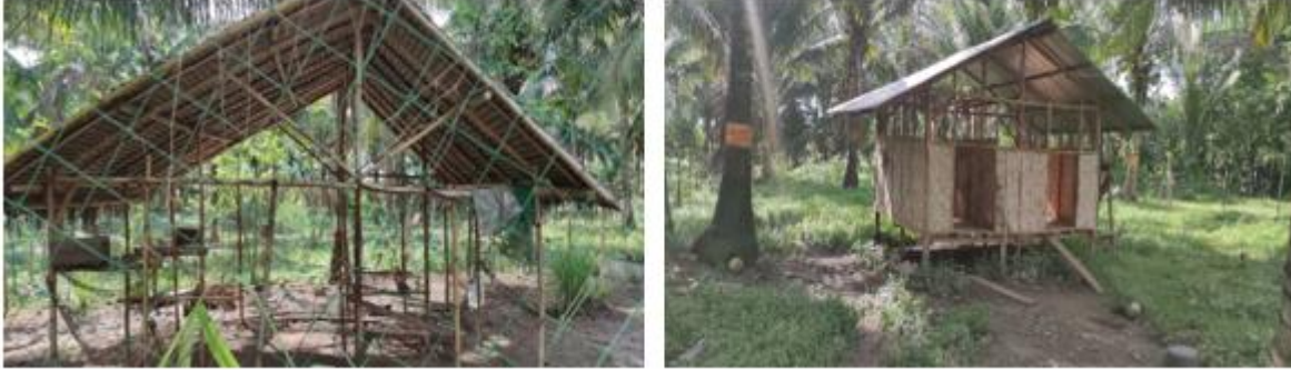
Figure 4. Existing duck house (left) and goat house (right).

Republic of the Philippines DEPARTMENT OF SCIENCE AND TECHNOLOGY DOST Regional Office No. XII and UNIVERSITY OF SOUTHERN MINDANAO Kabacan, Cotabato