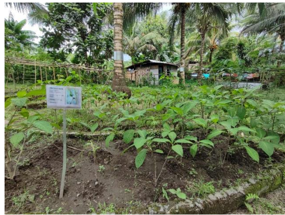
Figure 8. Newly established forage area of the farm. The area is planted with Madre de agua ang Indigofera