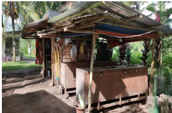
Figure 4. Existing rabbit house and cages.