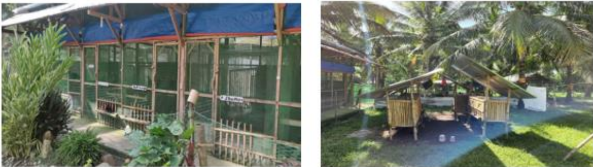
Figure 3. Existing chicken house (left) and brooder cage (right).