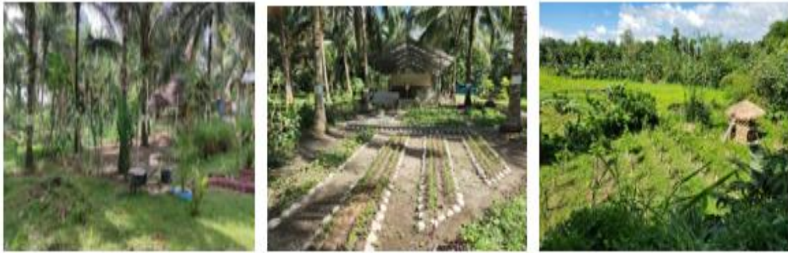
Figure 2. The landscape and crops planted in the farm.