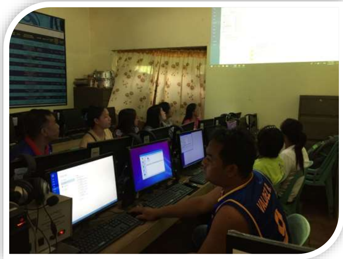
The participants of the training – workshops.