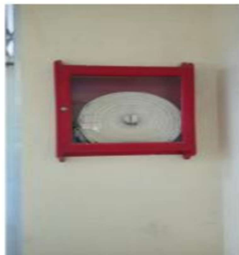
Fire alarm and fire hose located at the CAS Building