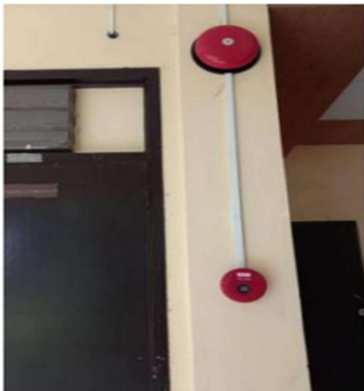
Fire alarm in CENCOM Building