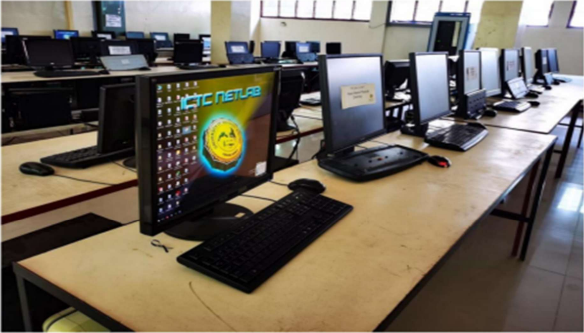
CE 10 Computer Laboratory