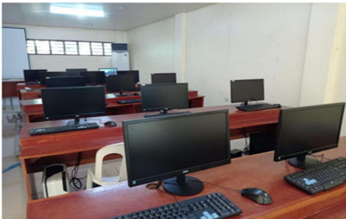
CE 11 Computer Laboratory