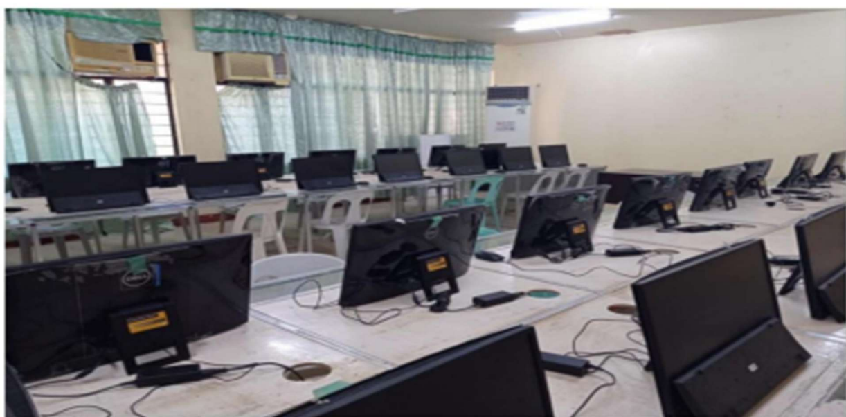
CE 16 Computer Laboratory

The Department of Computing and Library Information Science has four computer laboratories for Computer Subjects. Each laboratory room has a capacity of 30 to 35