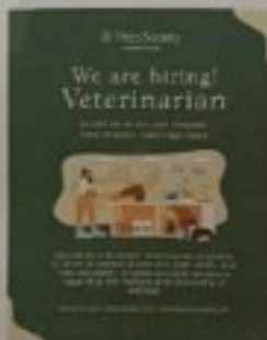
Copy of We are hiring veterenarian.png 227K