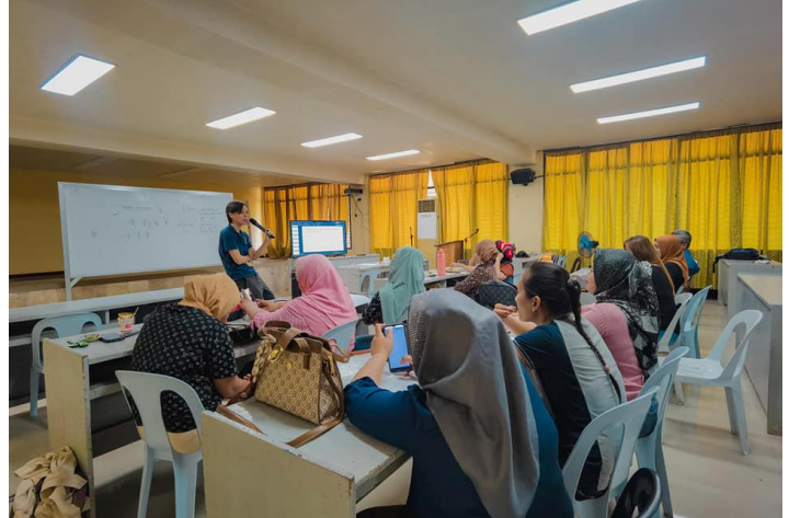
Group photo with Teachers of Nangaan Elementary School and USM - Math & Stat Faculty