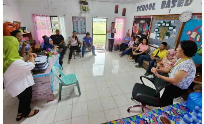
Inception meeting and conduct of needs assessment