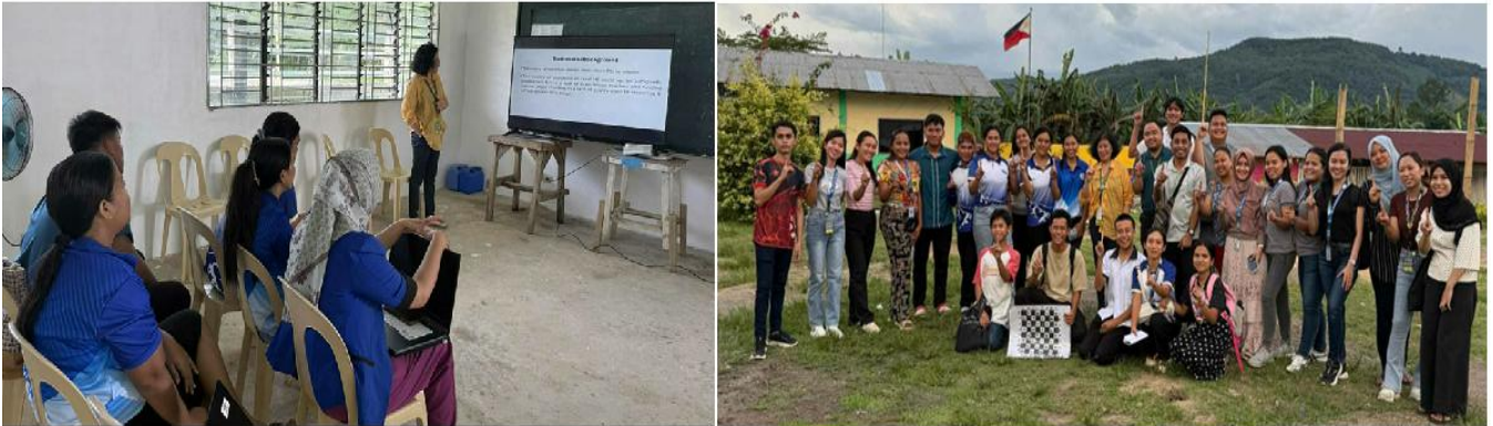
Orientation meeting with Salvacion HS teachers.