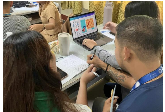
Participants collaborate actively during the hands-on workshop session