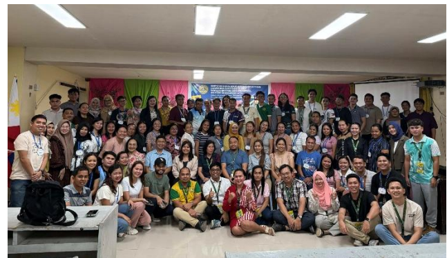
Group photo with participants and training facilitators from USM