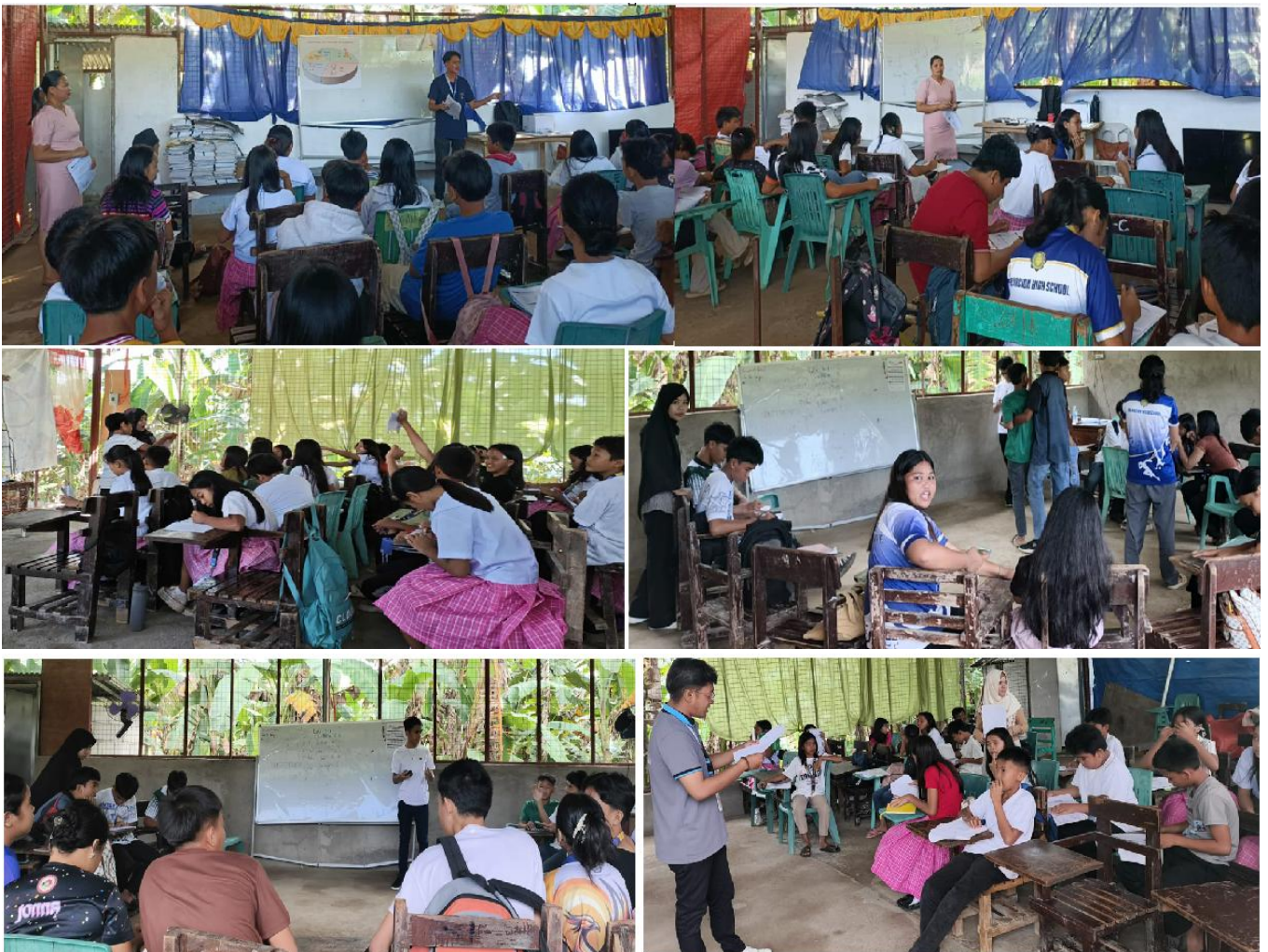
PhD Ed and MST math students during deployment and implementation of LMs