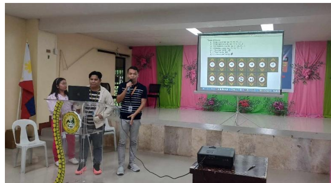
Workshop participants present their collaborative output to the group