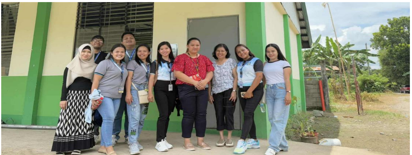
Courtesy meeting with the new principal of Salvacion High School.