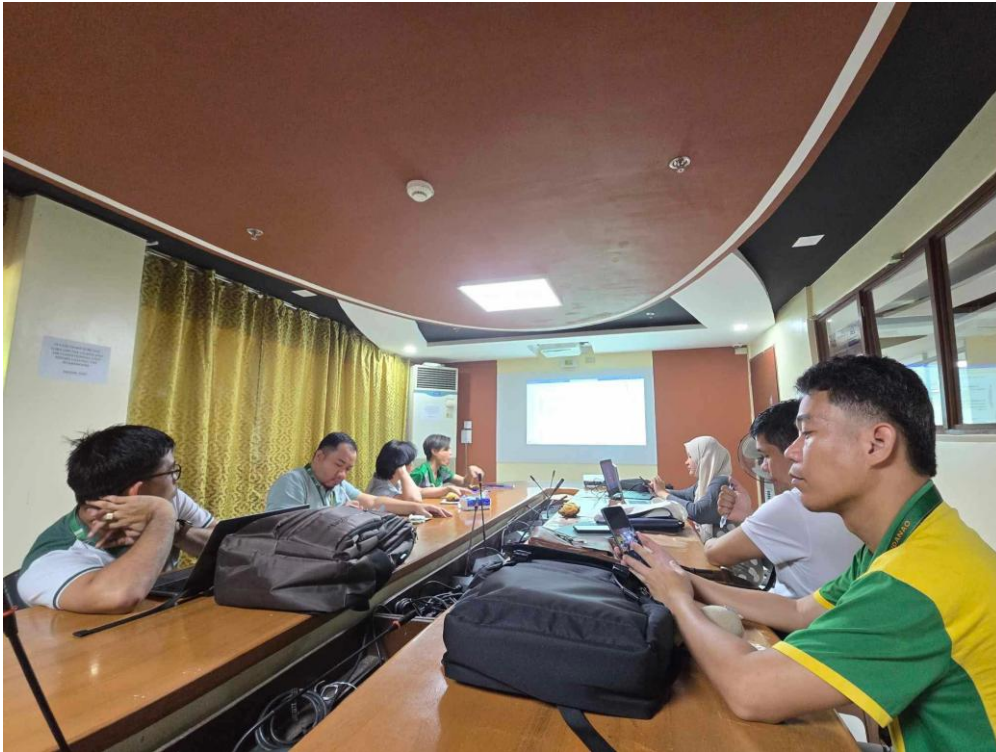
Planning Meeting for the 2025 Training-Workshop