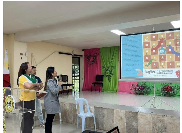
Workshop participants present their collaborative output to the group