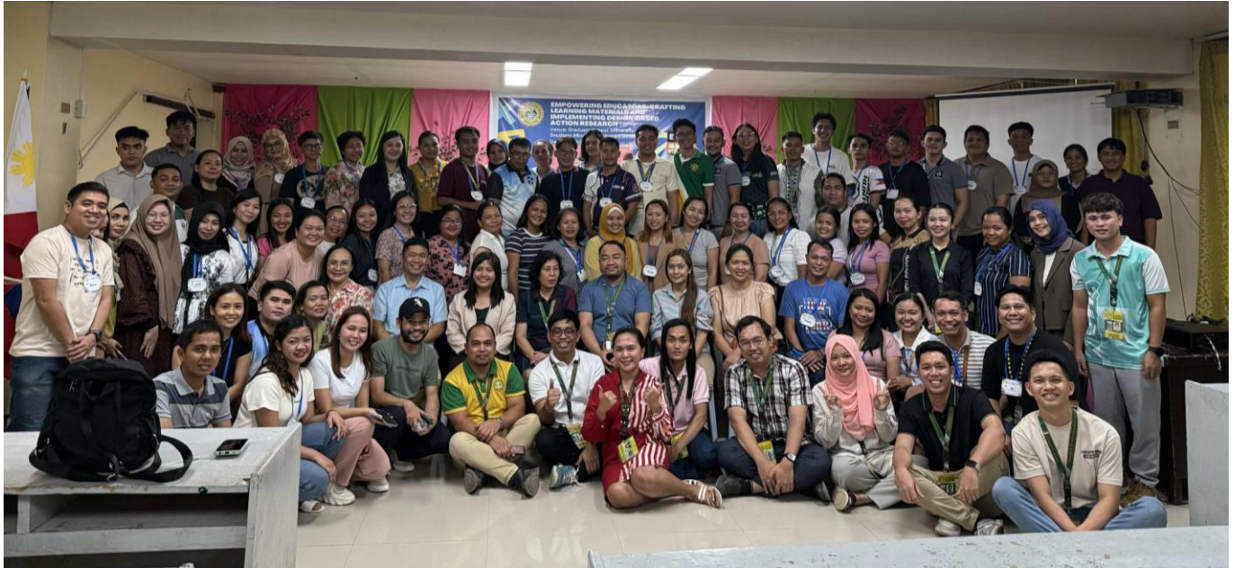
Group photo with participants and training facilitators from USM