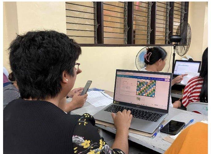
Participants collaborate actively during the hands-on workshop session